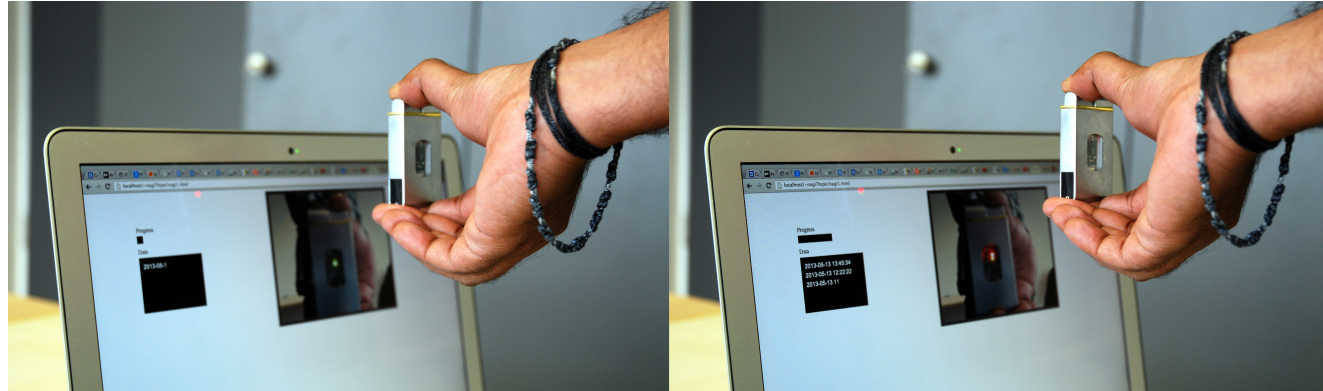
Figure 2: The system in use, the UbiLighter is sending data to the Javascript reception pipeline via the LEDs and webcam.

information will enter the signal demodulation, where the bitstream is checked with either the Hamming code or the CRC-8 check. The decoded information has then been successfully transmitted from the device to the PC and is displayed to the user on the visited webpage. After that this data can be uploaded to some remote server for further analysis or directly analysed in the Javascript program.